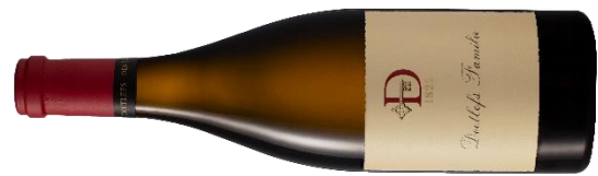
Deetlefs Familie White 2018