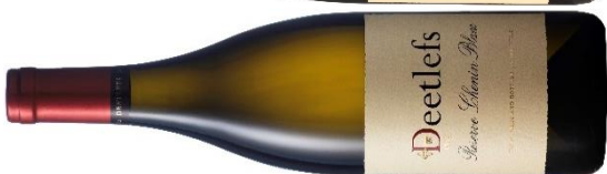
Deetlefs Estate Reserve Chenin Blanc 2018