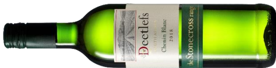
Stonecross Chenin Blanc 2020