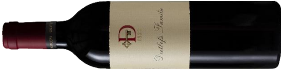
Deetlefs Familie Red 2017