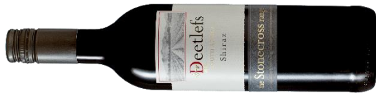
Stonecross Shiraz 2018