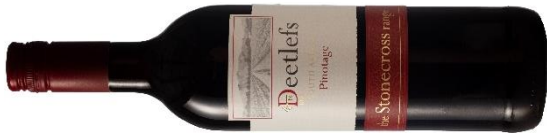
Stonecross Pinotage 2018