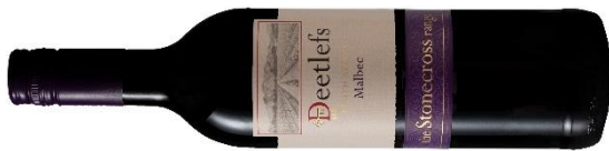
Stonecross Malbec 2020