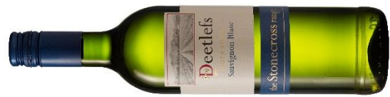
Stonecross Sauvignon Blanc 2021