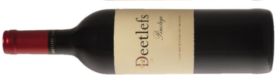
Deetlefs Estate Pinotage 2016