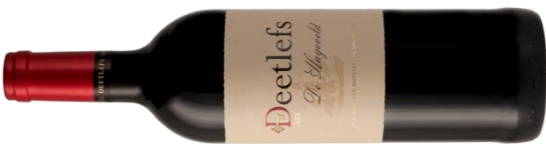
Deetlefs Estate De Hageveld Red 2018