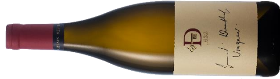
Deetlefs Signature Viognier 2019