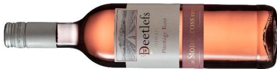
Stonecross Pinotage Rosé 2021