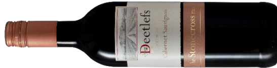
Stonecross Cabernet Sauvignon 2019