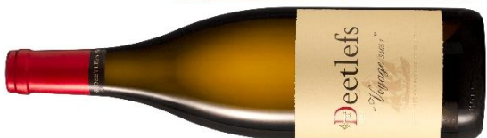
Deetlefs Estate Voyage 3566.1 2018