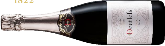
Deetlefs Estate MCC 2018 Brut - White Pinotage