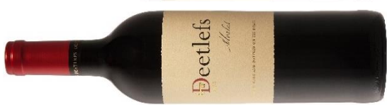
Deetlefs Estate Merlot 2017