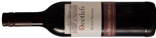
Stonecross Merlot Pinotage 2020