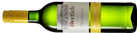
Stonecross Chardonnay 2020