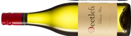
Deetlefs Estate Chenin Blanc 2018